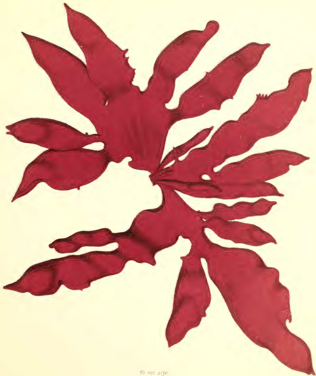
45 nat. size.